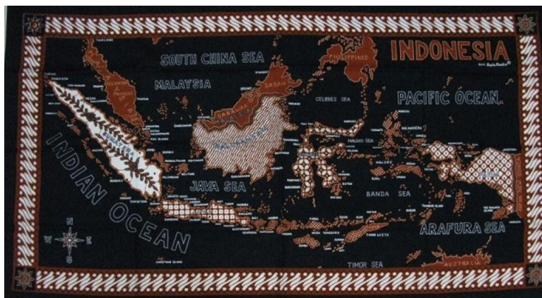
Map of Indonesian in Batik Painting