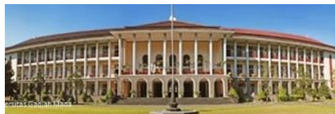
Universitas Gadjah Mada, Jogja