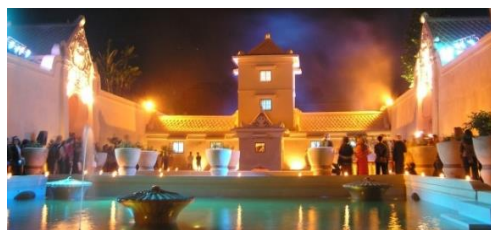
Tamasari Royal Perfume Garden, Jogja