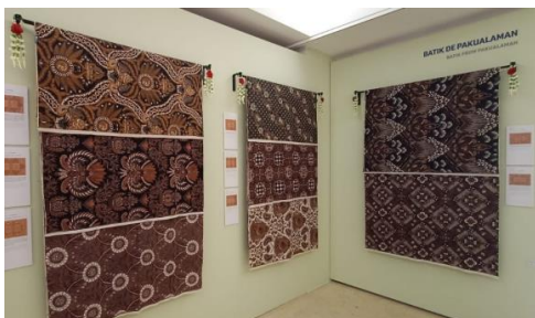
Jogja World Batik City Exhibition in Lisbon, Portugal, 2019