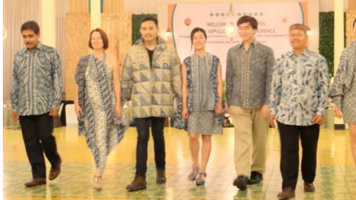
Jogja batik world class market, 2017