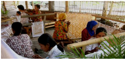
Reviving Folk Batik Imogiri Vilage, Jogja Post-earthquake, 2006 – 2007