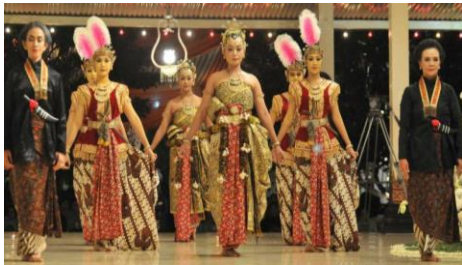
Batik for Performing Art