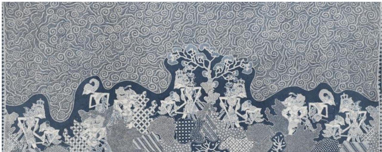
Hand painted Batik “KEMBANG PACAR WAYANG” Cotton, 243 x 105 cm Indigo 2 tones. Region: Gunung Kidul (k/GK/7178)