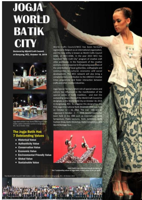
Jogja World Batik City, ca 2014