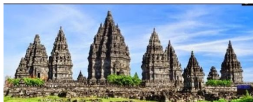
Prambanan World Culture Heritage, Jogja