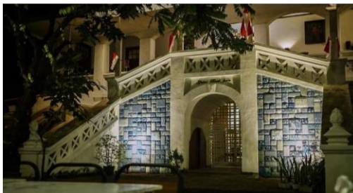
Batik Mural, 2019