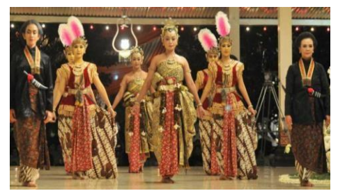
Batik for Performing Art