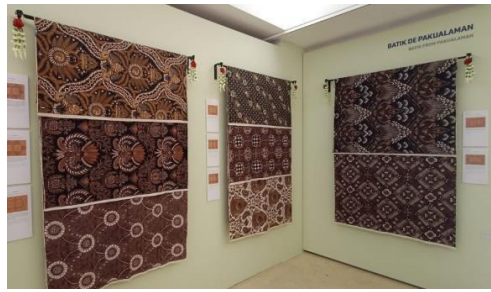
Jogja World Batik City Exhibition in Lisbon, Portugal, 2019