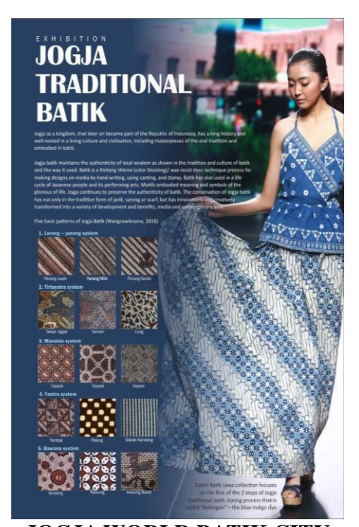
JOGJA WORLD BATIK CITY Architecture - Agriculture Batik Art Works & Villages - Culture Ecology & Landscape - Royal History