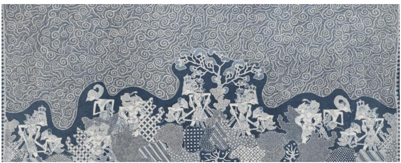
Hand painted Batik "KEMBANG PACAR WAYANG" Cotton, 243 x 105 cm Indigo 2 tones. Region: Gunung Kidul (k/GK/7178)