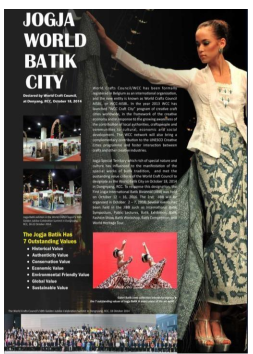
Jogja World Batik City, ca 2014