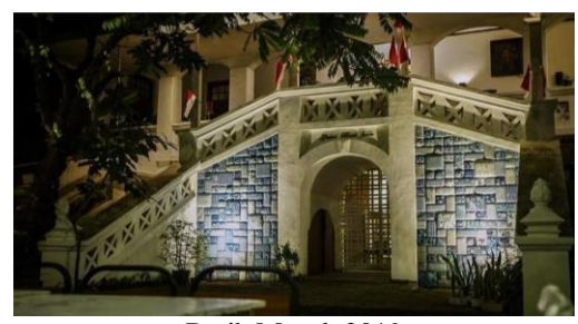
Batik Mural, 2019